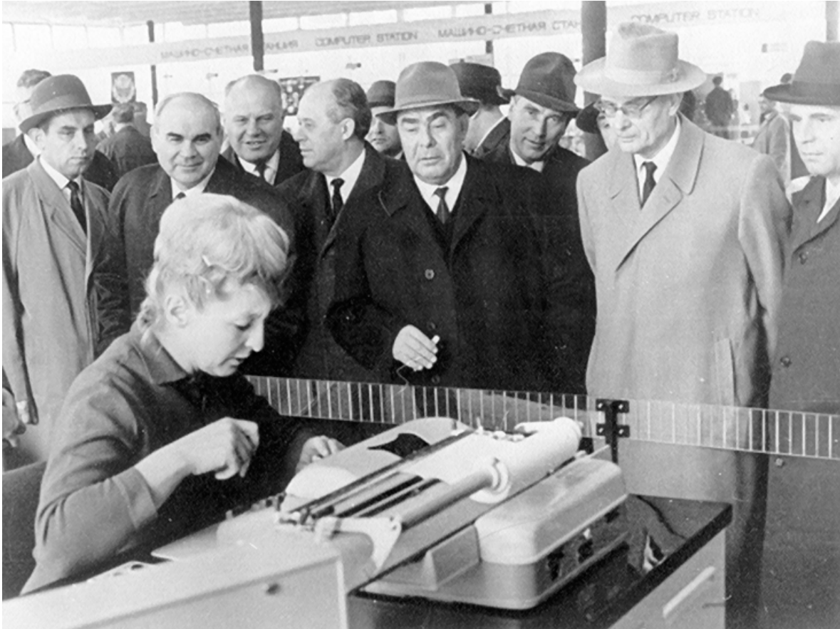
MACHINES OF COMMUNISM SERVE THE PEOPLE: Leonid Brezhnev, General Secretary of the Communist Party, watches a demo of a specialized Soviet computer for engineering applications at an exhibit in Moscow.